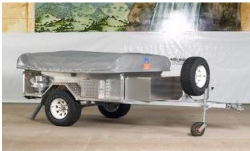
Soft Floor camper - closed

"Soft Tops" have a vinyl floor sewn to the walls that sits on the ground when open, and folds on top of the tent & trailer when closed. It should have a "floor saver" ground sheet under the floor when open and a separate travel and storage cover when closed. Advantages of "soft tops"? They're light, ease of use and have tent floor areas far larger than their trailers. Soft Tops also come in small, simple lightweight packages for comfortable couple cruising. Soft Tops are usually cheaper to buy.