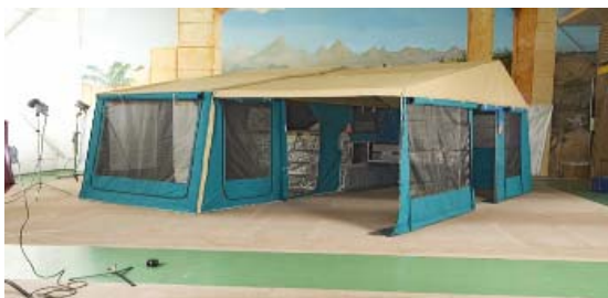
* large windows in the annexe is a must! This is the place where you do all your cooking & living!

The windows should be large and meshed. The floor should be easily cleaned or dusted off. The frame work, for ease of use, should be free-standing and easily handled by one person. The annexe walls should separate or detach from the roof, allowing versatility of set-up style. All these things (which you may not have thought about), make life just that much simpler and the simpler, the quicker you can get on with enjoying your time out.