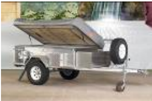
Full top opening

Access to your “stuff”. This is either gained through the tailgate and usually one other way - either through access under the bed when tent is opened, or by opening up the bed base when the tent is closed. Choice? This is up to you entirely and no one way is better than the other, you just need to be mindful of the sealing of the access, to prevent dust & water from getting inside the trailer.